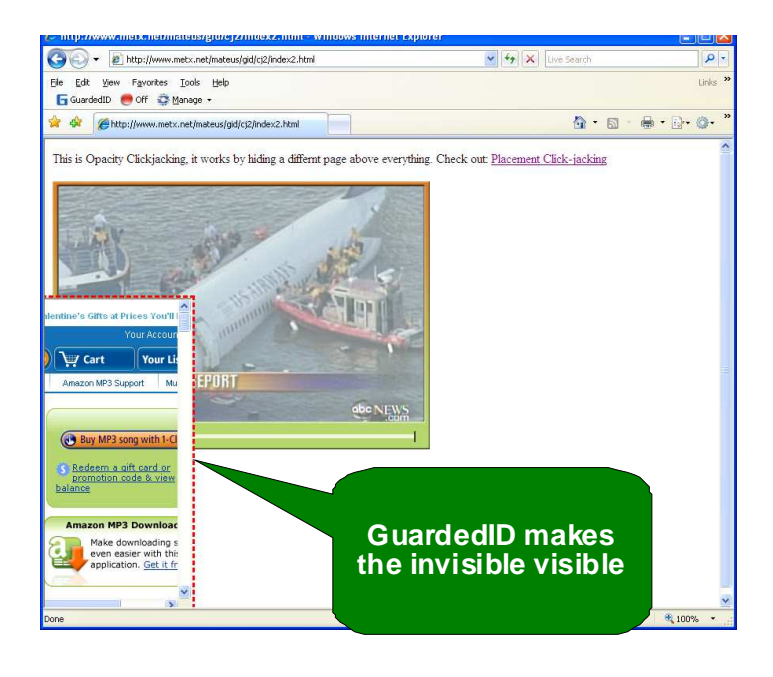
Figure 3. Anti-Clickjacking